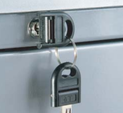
Central locking with folding key.