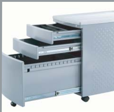
Heavy duty smooth running slides with fifth wheel for strength and stability and full extension runners.