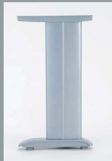
Return Leg 695H x 420D