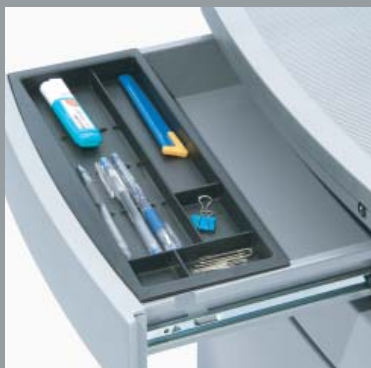
Stationary tray to top drawers.