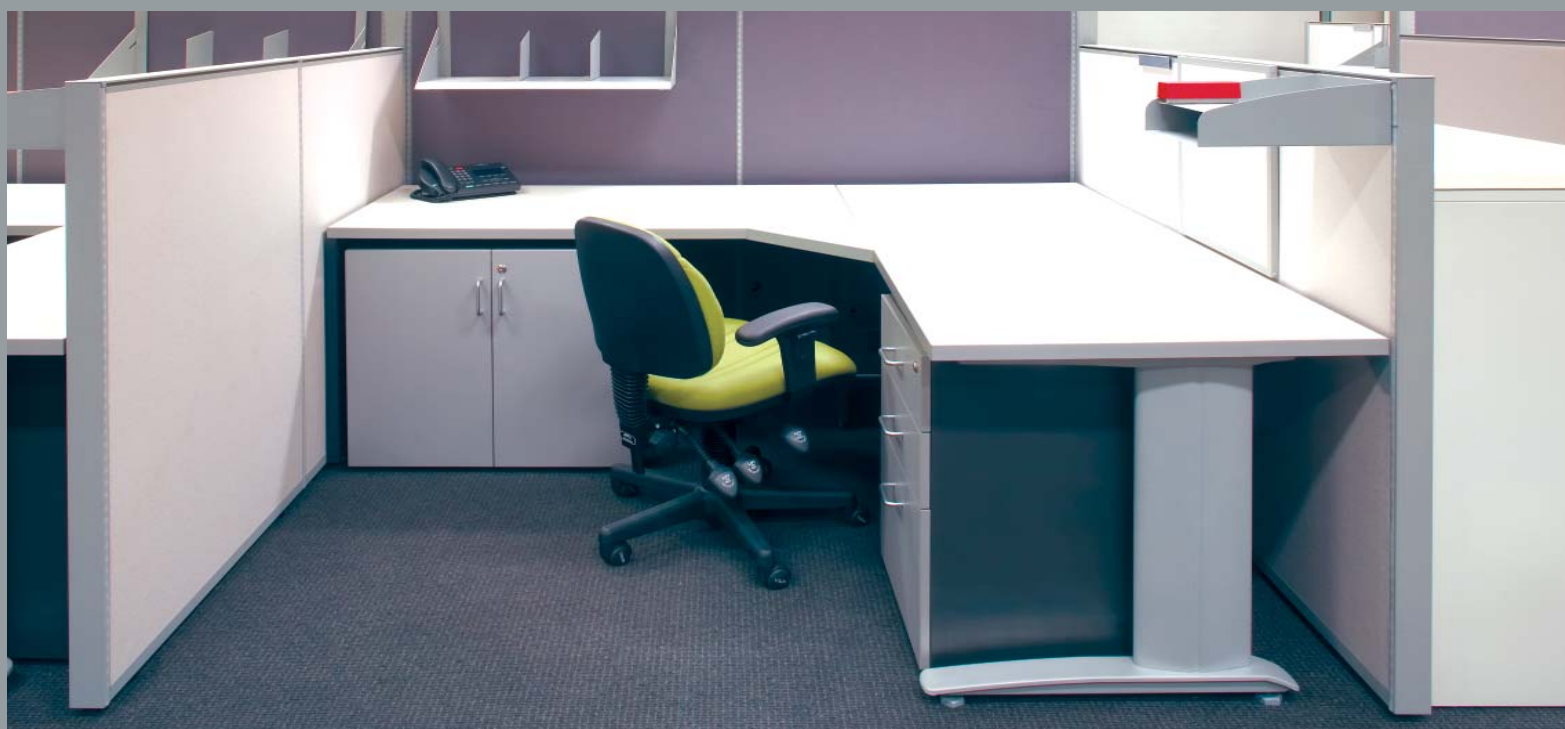
650D Desk legs used in workstation configuration.