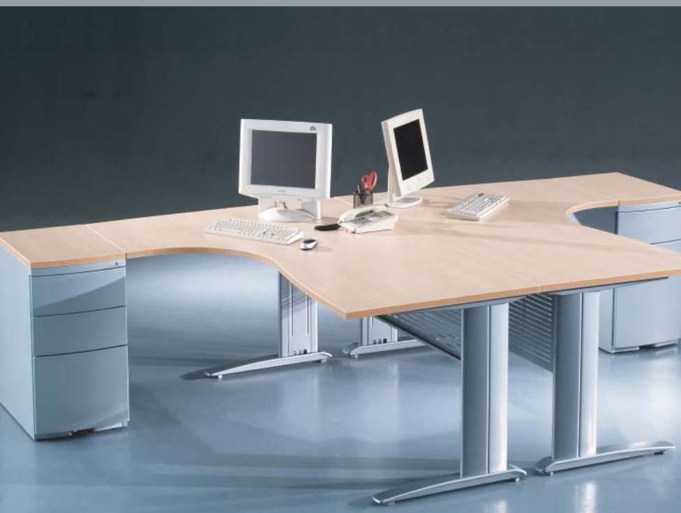
Back to back L-shape desks frame with corner timber tops and mobile pedestals.