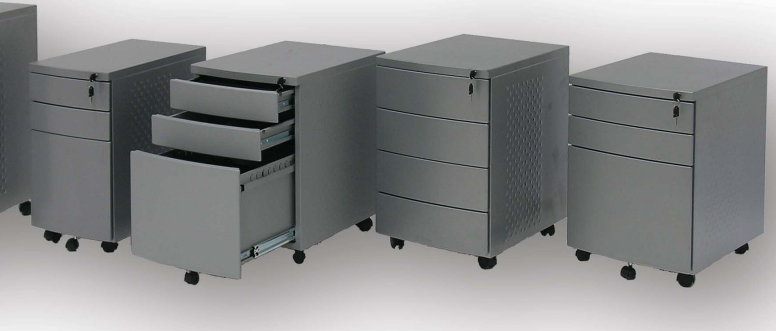
Slim 2 Personal | File Drawer 562H x 310W x 565D