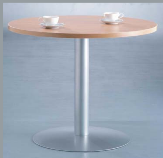
Round pedestal base 695H x 600D to suit up to 1200 top.