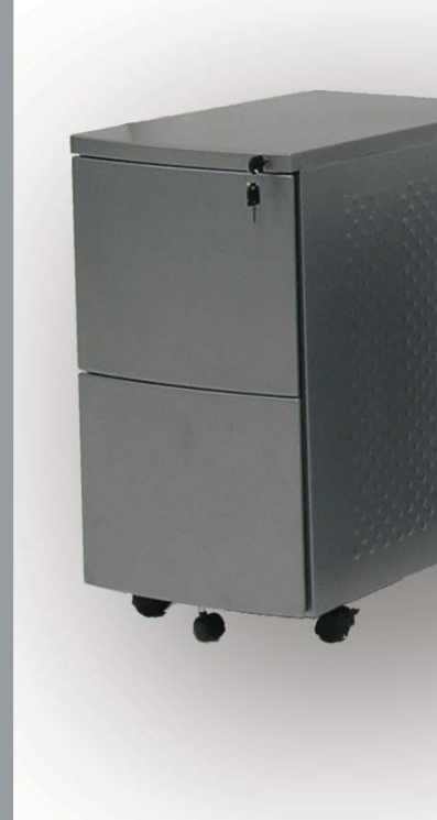
2 File Drawers 690H x 392W x 565D