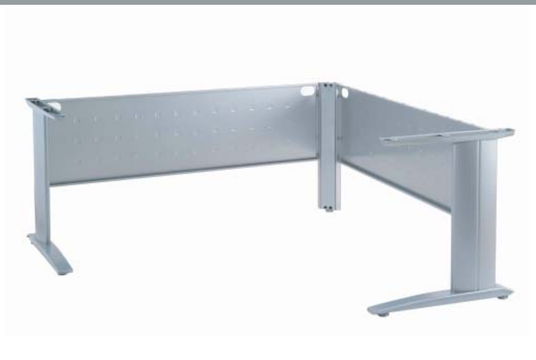
L-shape desk frame with corner legs and steel modesty's.